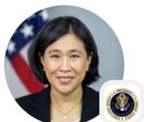
Ambassador Katherine Tai United States Trade Representative