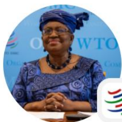
Dr Ngozi Okonjo-Iweala Director-general World Trade Organisation

For the latest agenda and speaker line-up, please click here :