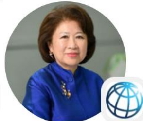
Mari Pangestu Managing director for development policy and partnerships World Bank and former trade minister Indonesia