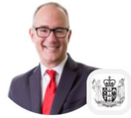
Hon Phil Twyford Minister of state for trade and export growth New Zealand Government