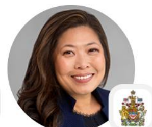
Mary Ng PC MP Minister of small business, export promotion and international trade Government of Canada