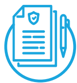
Cities, communes, countries, voivodeships