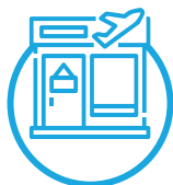
Travel agents from Poland and abroad