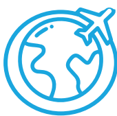
Tourist states and regions