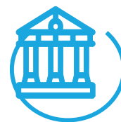
Monuments in Poland and abroad