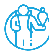
Meetings with travelers